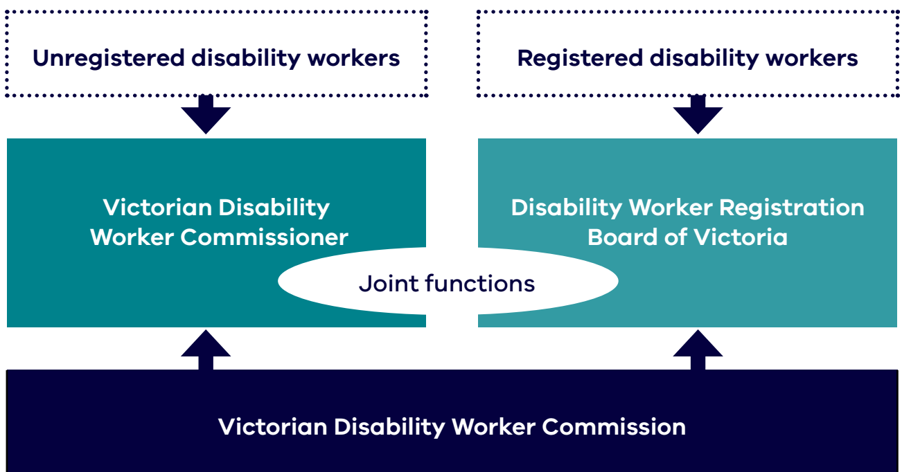
Figure 1: Interrelationships between the Commission, the Commissioner and the Board