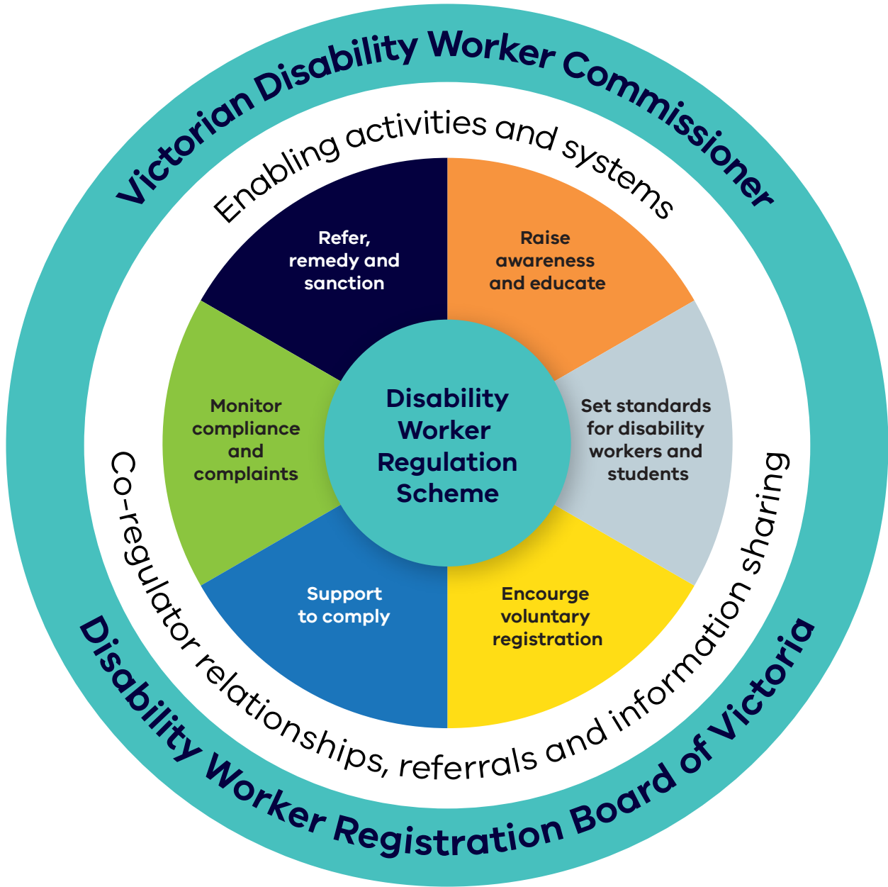
Figure 2: Our regulatory approach

Alternative text for diagram: A circular diagram depicting the regulatory approach. The outer ring depicts the Victorian Disability Worker Commissioner and the Disability Worker Registration Board of Victoria as the two statutory bodies delivering the Disability Worker Regulation Scheme. The next ring depicts the over-arching ways these bodies apply their authority and influence: enabling activities and systems, co-regulator relationships, referrals and information sharing. The inner ring depicts the methods used to deliver the approach: Raise awareness and educate; set standards for disability workers and students; encourage voluntary registration; support to comply; monitor compliance and complaints; refer, remedy and sanction